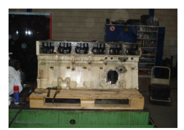
Hole in engine

Doddema Locking is a specialized company in repairing broken or cracked cast iron / cast steel. We repair it with Locking. Locking is a procedure that do not use any kind of heat sources. It's a so called 'cold' repair.