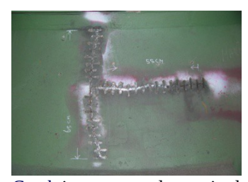
Crack in pump partly repaired