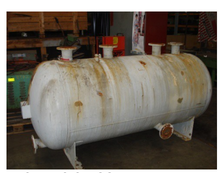
Tank voor behandeling van coaten