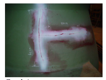
Crack in pump

With Locking the crack will be incarcerated. We do this by placing a Lock at the beginning and place a Lock at the end of the crack. Locks are made of a special iron/nickel alloy. Locks a placed 90 degrees of the crack or broken piece. Then we place more Locks along the crack or broken piece. This makes sure that the strength will be returned in the object and closes the crack so far as possible. Between the Locks we place special studs. These special studs make sure that the object is leakproof. We can repair almost any kind of cast iron/cast steel.