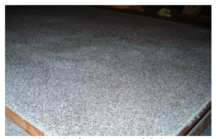
Anti-slip platform on prefab base.