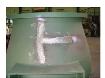
Crack fully repaired