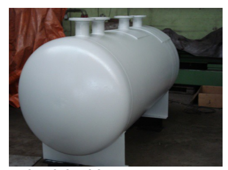
Tank na behandeling van coaten